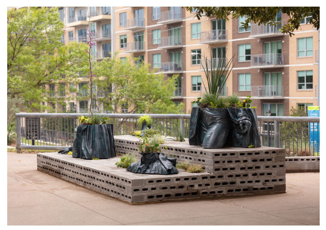
Iván Argote's Wild Flowers

Begun in 2021, Wild Flowers is an ongoing series of immersive installations comprised of scattered cast bronze fragments of a figurative statue. Appearing as if nature has taken over and playing upon notions of monuments and time, the artist prompts the viewers to wonder if the statue is being removed, abandoned, or getting ready to be installed.