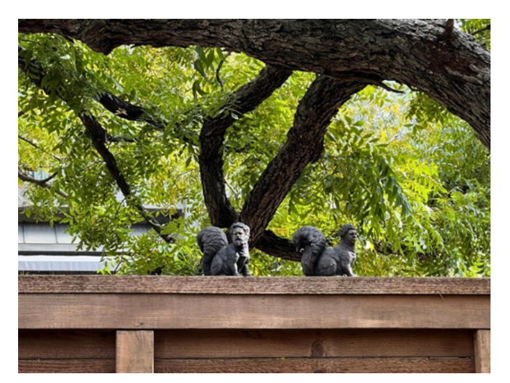
Sculptures by Jeff Gibbons and Gregory Ruppe

The Gibbons/Ruppe installations comprised a series of vignettes featuring sculptures of squirrels that appeared at intervals along the Trail. The works blended naturally into the environment of the Trail, distinguished from the real animals only by their fixity, as well as their uncanny human faces.