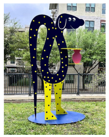
Hadi Fallahpisheh sculpture

With "Guest," Hadi Fallahpisheh presented a series of four uniquely crafted and boldly painted monumental steel sculptures. These towering shapes of steel took up residence along the Katy Trail, marking the distances and animating the changing landscape.