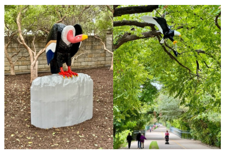
Turkey Vulture & Desert Eagle by Will Boone

Transformed from culture icons into bronze monuments and then back, once again, into symbols of American life, Boone imagines these works undergoing still another alchemical and metaphorical change: unearthed by another civilization long after the artist's existence, the sculptures will have shed their paint and oxidized, their materiality enduring like that of the ancient world.